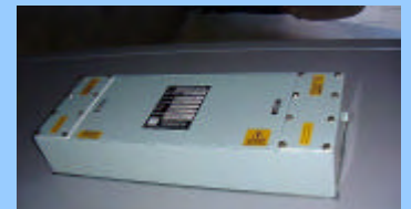
RF electrical filter