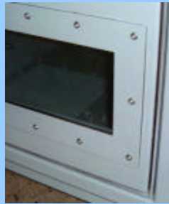
RF cabinet for EMC testing with RF window