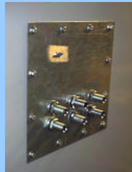
Connector panel with fibre optic penetration tubes