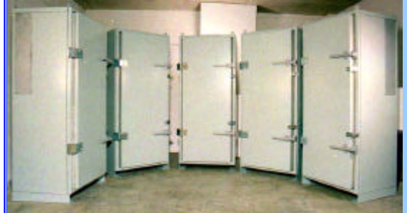
Set of EMP cabinets for military communications equipment

All cabinets are designed to specific client requirements and as such can incorporate features such as power, telephone and data filtering as well as ventilation, internal racking or special fixings.