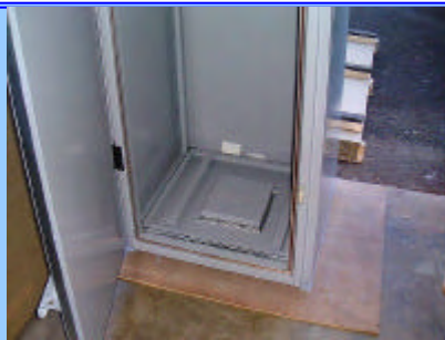
EMP cabinet showing RF shielded air vent in the base