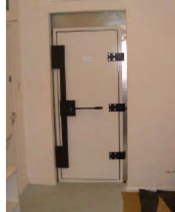
RF shielded single knife edge door with 2 point latching on modular steel room

Extended performance at both higher and lower frequencies can be offered