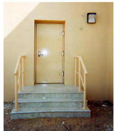
RF shielded door modified for external use