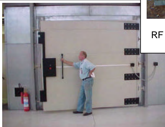
Large single leaf door with pneumatic latches for vehicle test chamber