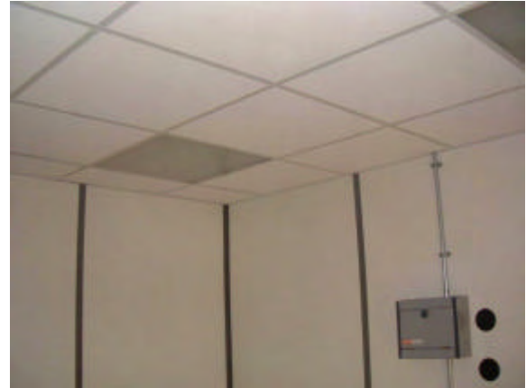
Internal view of room after installation of decorative linings