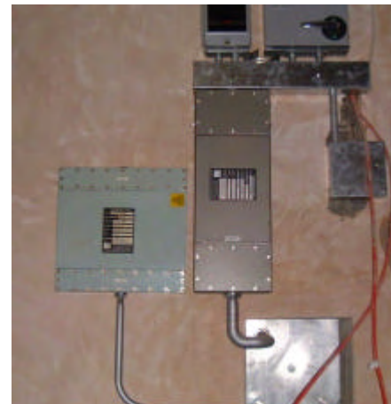
RF shielded filters mounted externally to the shielded room and connected via shielded conduit