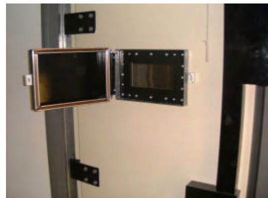
View of RF shielded door with shielded hatch over security window.