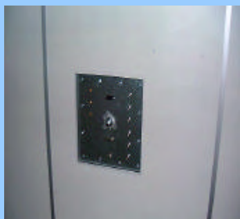
Removable penetration plate with FO pipe and connectors.