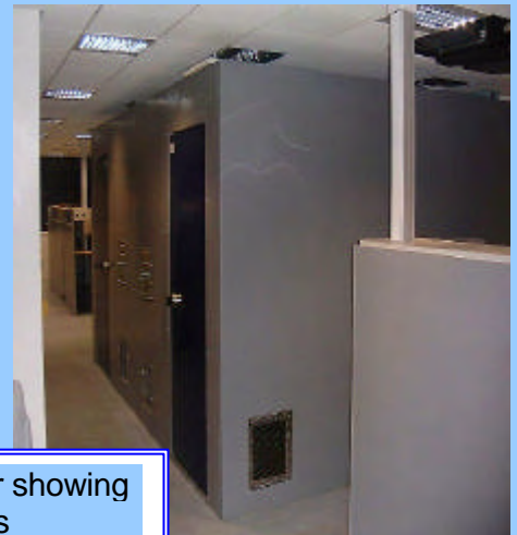
External view of chamber after installation