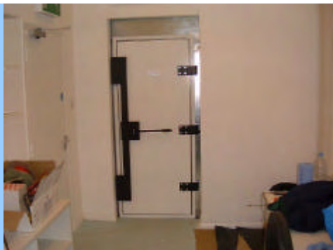
External view showing RF shielded door

Magnetic mode: 60dB at 10 kHz to 100 kHz at 100dB Electric Mode: 100 dB from 1 kHz to 100 MHz Plane Wave: 100 dB at 1 GHz