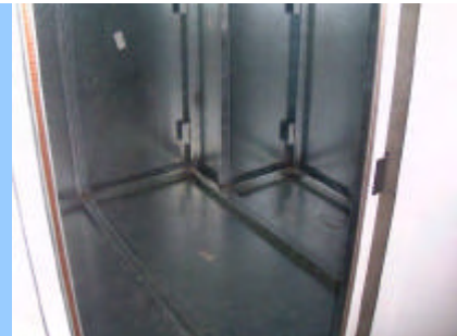
Internal view showing RF shielded panels before internal decorative linings

DIMENSIONS 2100 mm L x 2500 mm W x 2500 mm H