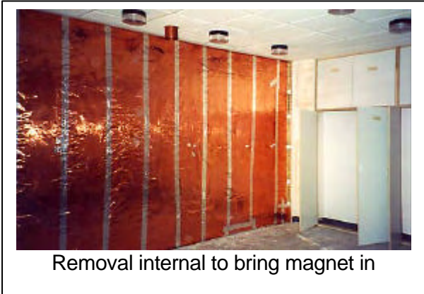
Removal internal to bring magnet in