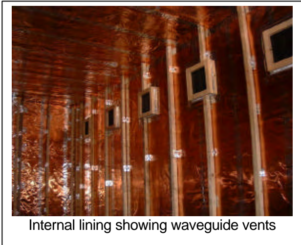
Internal lining showing waveguide vents