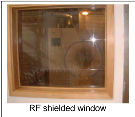
RF shielded window