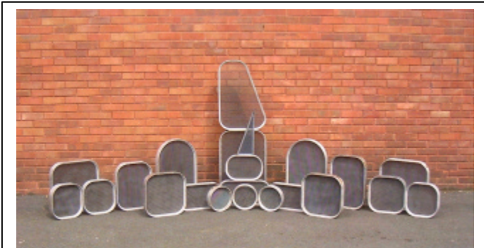
Selection of single piece waveguides showing variety of shapes

EEP are supplying stainless steel honeycomb waveguides, they have been especially designed to meet the Navy's RF (Radio Frequency) shielding and RCS (Radar Cross Section) requirements. Particular special anti corrosion paint finishes were also required.