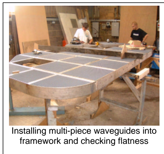
Installing multi-piece waveguides into framework and checking flatness