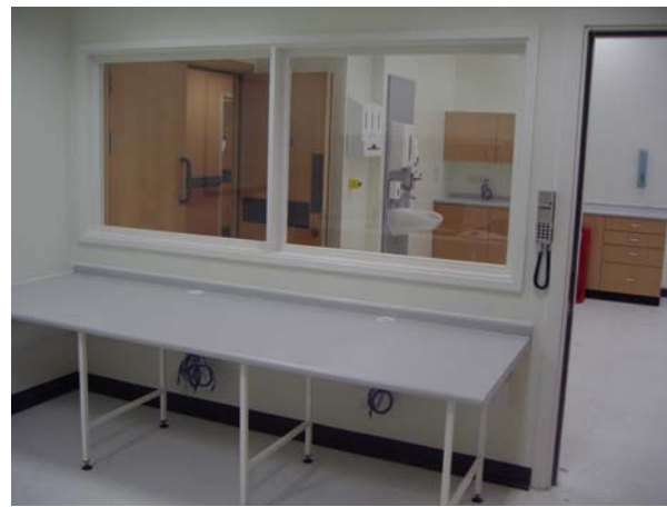
Viewing window for CT scanner