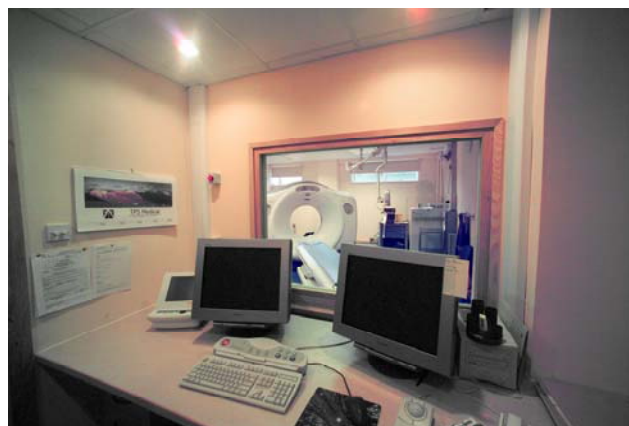
CT scanner room window