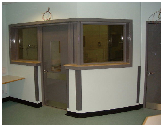
External view of veterinary X-ray room showing leaded windows and door

As each project is unique, EEP can supply windows with a wide range of frame designs and finishes to match the rest of a building. All additional requirements, such as fire and acoustic ratings, can be included.