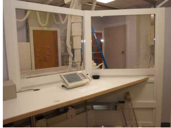
X-ray Room Screen with integral desk and electrical distribution