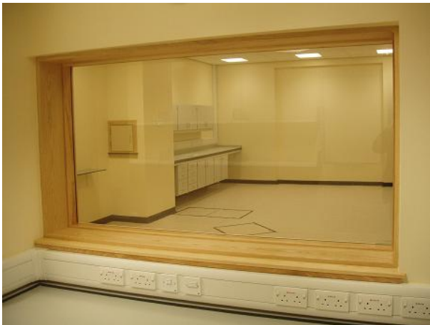
Viewing window for PET scanner