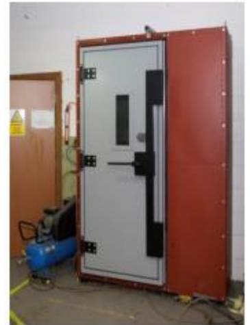
Pressure Test Chamber

Jurong Island Gas Terminal Bahrain Defence Forces United Kingdom Ministry of Defence, various sites United States Navy, RAF St Mawgan United States Air Forces, RAF Mildenhall Astra Zeneca, Research Centre Cambridge United Kingdom Water Authorities, various Water Treatment Plants