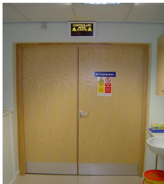
Ash Veneered Lead Lined Door for CT Scanner Room