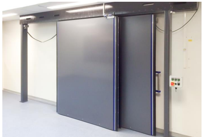
Ionising Radiation Shielded Sliding Doors