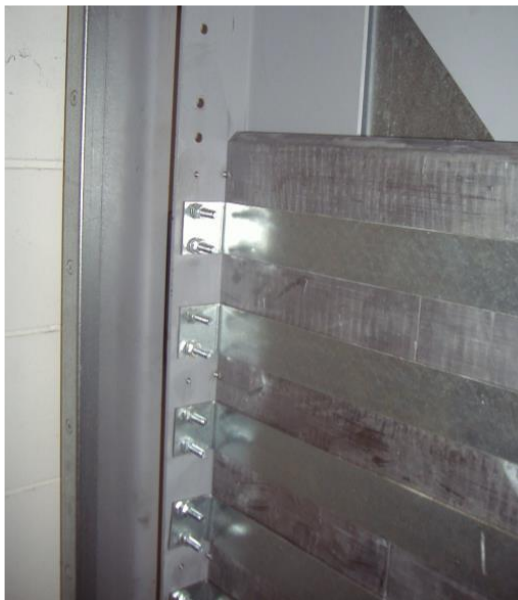
Internal Lead Blocks Fitted

Complete or supervised installation is optional by EEP.