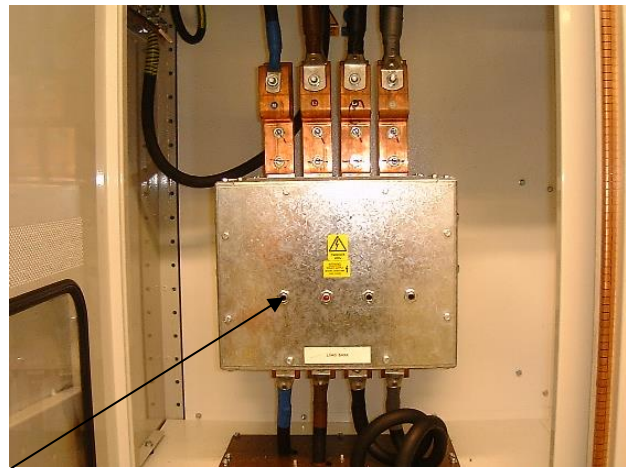
Installed Surge Suppression Filter Unit